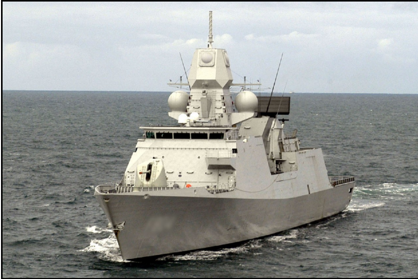
Thales APAR on a Dutch LCF De Zeven Provinciën class frigate

The architecture of Roos Instruments' Cassini High Speed Precision RF & Microwave Automated Test Equipment (ATE) system delivers exceptional value in the production testing of Active Electronically Scanned Arrays (AESA), also called Active Phased Array Radar, for both aircraft and shipboard programs.